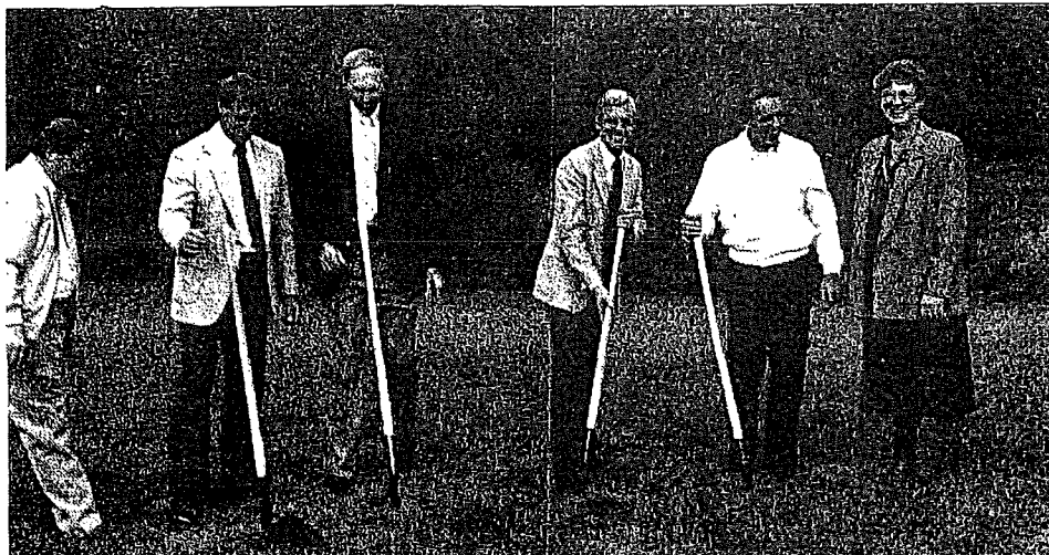
Board members break the ground

Long-range perspective: "In 1985 the Board established a planning committee to advise them on the long-range issues facing Covenant Christian High